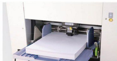
Innovative design of paper feeding by double rollers which is much more stable. Simultaneously feed paper to guarantee one page input only once.