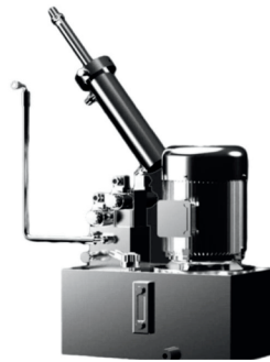
Double Hydraulic Power Control System