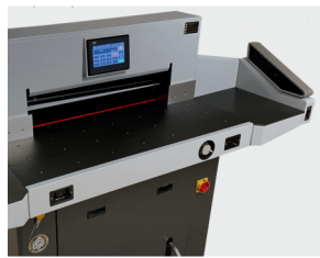
720X720 mm width size